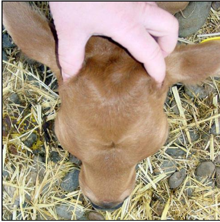
1. Locate horn buds.