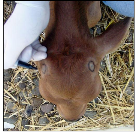
3. Outline sites with a marker.