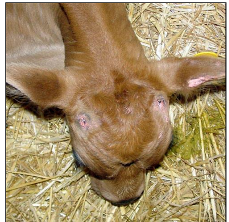
6. Paste after 24 hours.