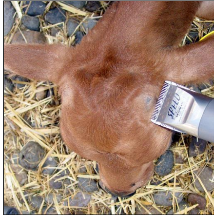
2. Clip hair.